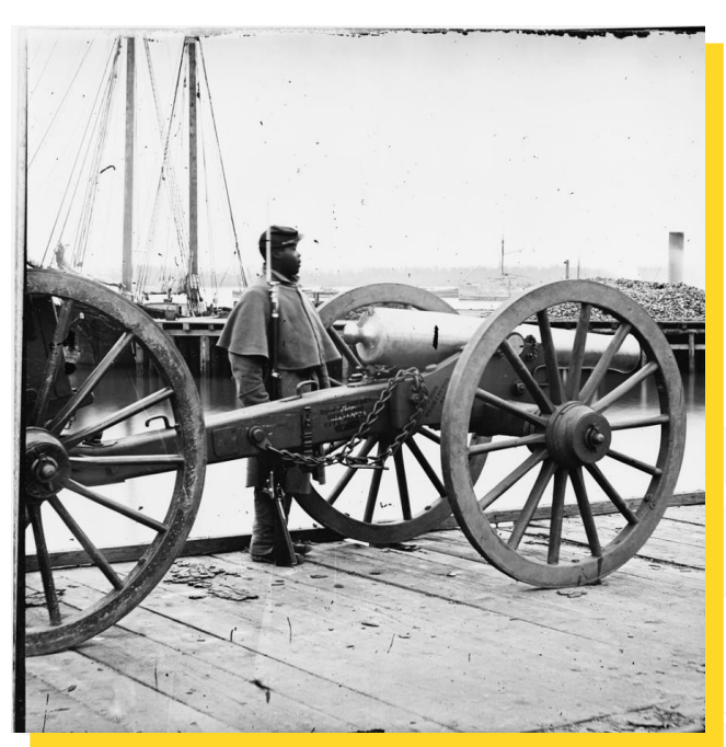
African American Union Soldier, 12-pdr Napoleon c. 1860