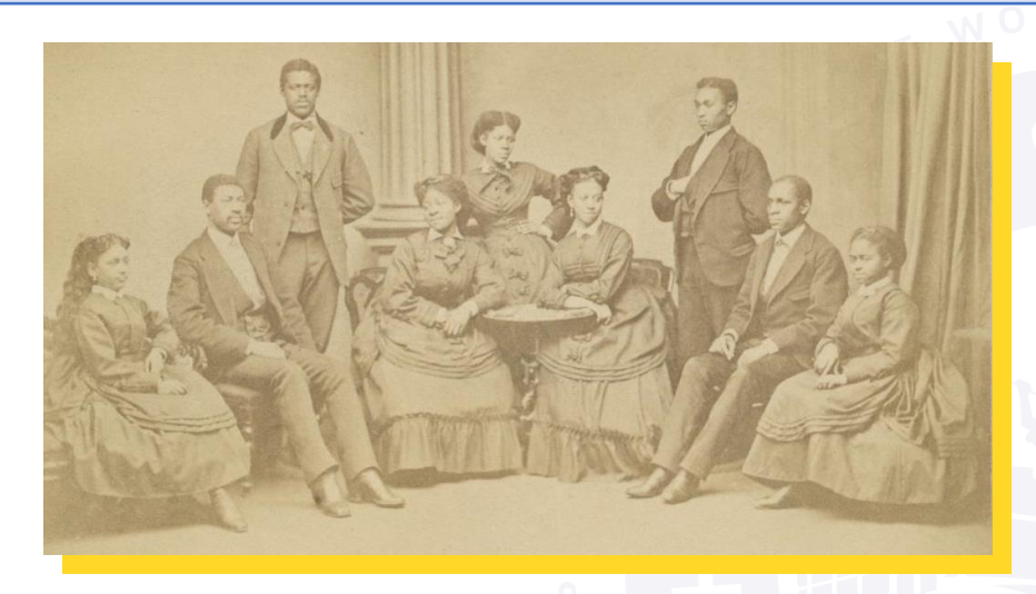
Fisk University Jubilee Singers, c. 1872