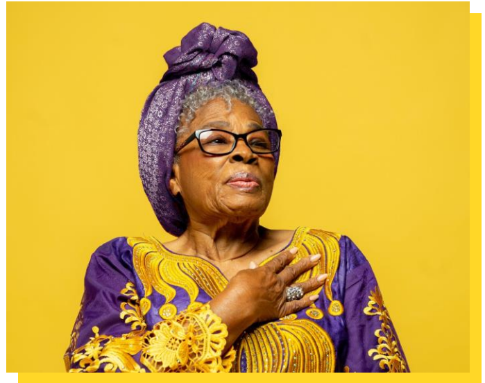
Ms. Opal Lee, 2022