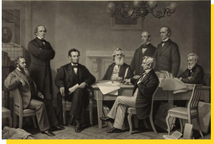
The first reading of the Emancipation Proclamation Painted by F.B. Carpenter

It was the end of the second year of the Civil War; more than 100 battles had been fought and neither side was winning. The North had lost many men in the war. The South was using slave labor in many ways to fight and support their efforts in the war. Congress had passed small ways to award freedom to escaped slaves. But by making an executive order—a proclamation—President Abraham Lincoln was taking away slaves throughout the “States and parts of States which...are in rebellion against the United States,” to aid the North.