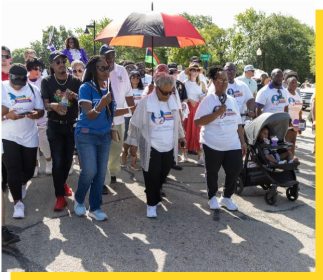
Opal Lee and others on the Walk of Freedom, 2021

She and others campaigned for years to make Juneteenth a national holiday. She would lead a walk 2 ½ miles each year, representing the 2 ½ years it took for news of the Emancipation Proclamation to reach Texas.