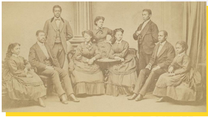
Fisk University Jubilee Singers, c. 1872