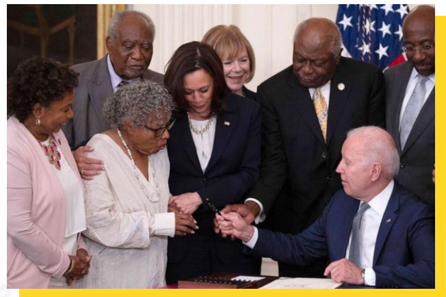
Opal Lee, Vice President Harris and President Biden on June 17, 2021.