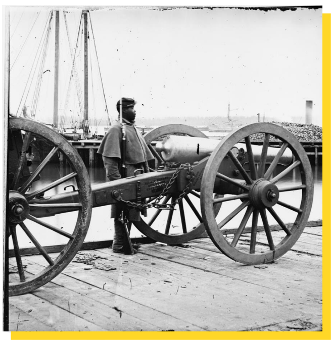
African American Union Soldier, 12-pdr Napoleon c. 1860