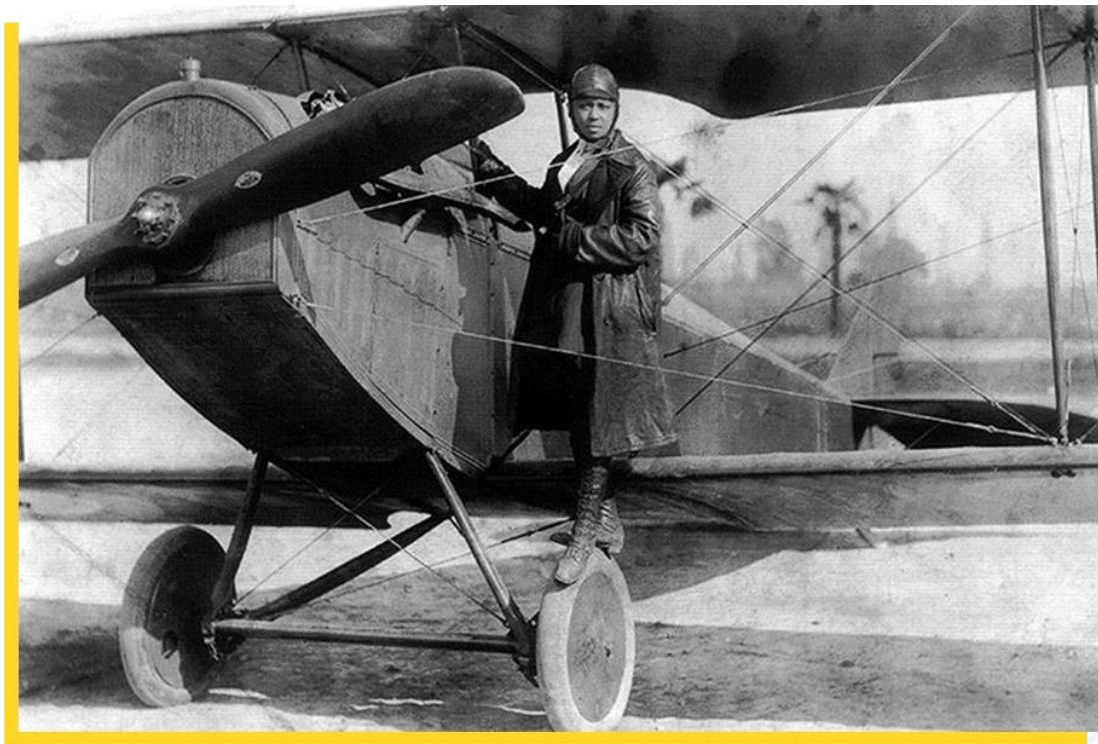
Bessie Coleman with a Curtiss JN-4D, “Jenny” c.1924

She worked for four years as a manicurist, while living with her older brothers. They had come back from World War I, with stories of women who were flying planes in Europe. That sparked her imagination, giving her dreams of learning to fly planes. No women, and no Black Americans, flew planes at that time in the United States.