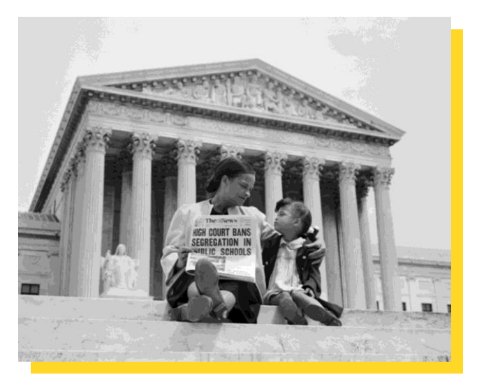
A mother and daughter sit on the steps of the Supreme Court Building, c. 1954

The case originated in 1951 when the Topeka, Kansas, public school district refused to enroll the daughter of local black resident Oliver Brown at the school closest to their home. Instead, they required her to ride a bus to a segregated black elementary school farther away.