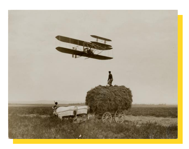
Wilbur Wright piloting the 1908 Wright Flyer in Pau, France.

Their bicycle repair business began to expand, and they eventually had five locations. They found out that airplanes and bicycles had a lot in common and towards the end of the 1890's, they began to build experimental airplanes. These first experimental unmanned airplanes, called Gliders, were nothing more than giant kites. They invented techniques in aeronautical engineering and flight testing that is still used today.