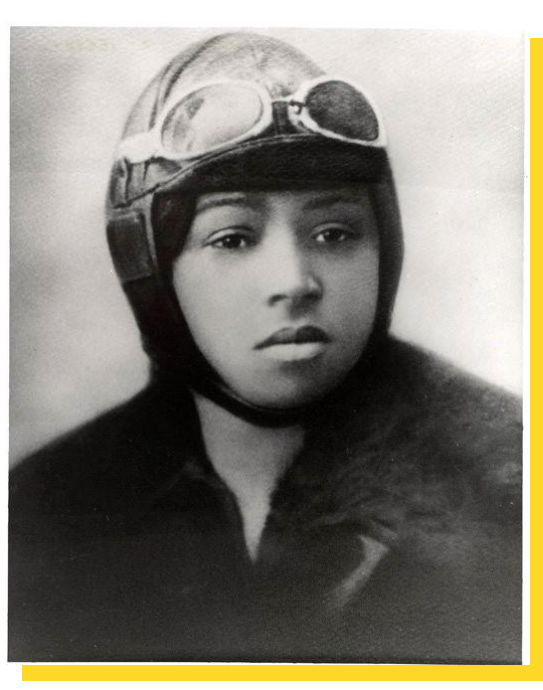
Bessie Coleman c. 1921

With the backing of Robert Abbott, the influential owner of The Chicago Defender , the most popular Black newspaper in the area, she applied to flight school in Paris and was accepted. She taught herself to speak French, boarded a ship to France, and nine months later in 1921, had become the first female and the first African American to attain an International flight license. In Europe, she was considered one of the best flyers they had ever seen.